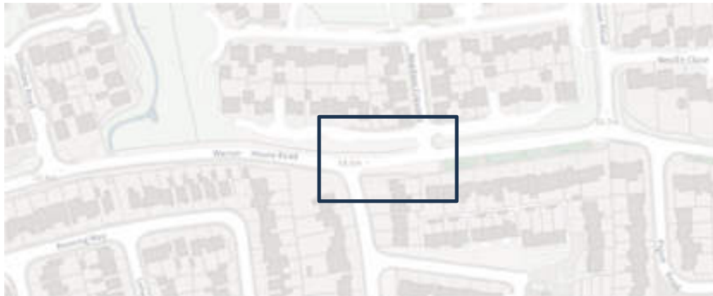
Figure 1 - Location of proposed crossing

Use this box to summarise/add any information not included above